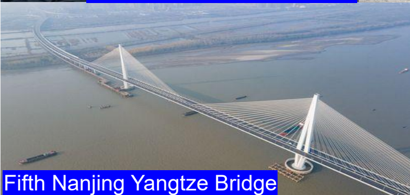
Fifth Nanjing Yangtze Bridge