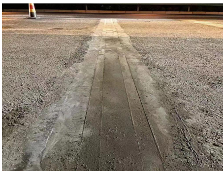
Wet joint of UHPC