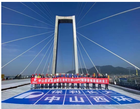
UHPC steel deck pavement