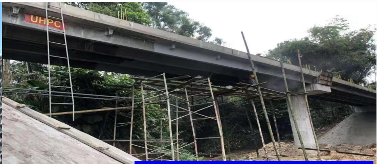
UHPC bridge in Vietnam