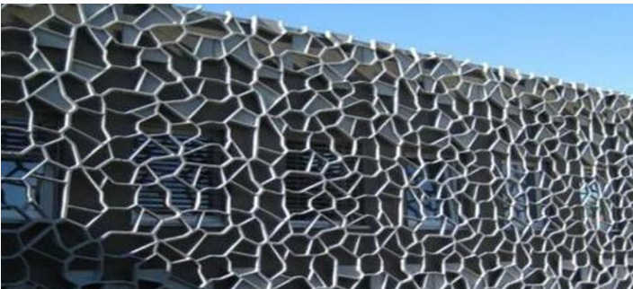
UHPC exterior wall in Korea