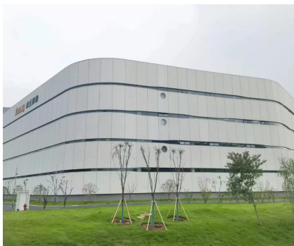
UHPC exterior wall decorative panel